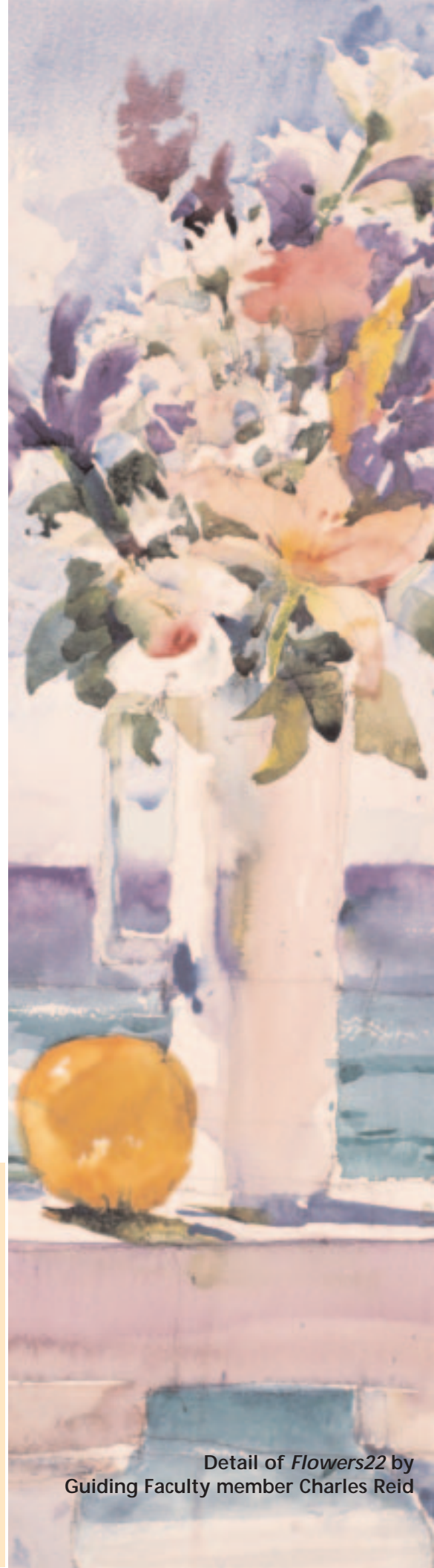
Detail of Flowers22 by Guiding Faculty member Charles Reid

Look inside for a photo of the full Course contents and the topics covered in the ten Lessons of the Basic Certificate Course.