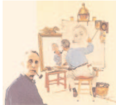
Norman Rockwell, one of the twelve successful artists who founded Famous Artists School

Look inside for a photo of the full Course contents and the topics covered in the ten Lessons of the Basic Certificate Course.